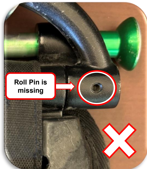
Figure 3: Roll Pin Inspection

Please remember to review the full user manual, 10191702, for all required inspection steps and frequencies.