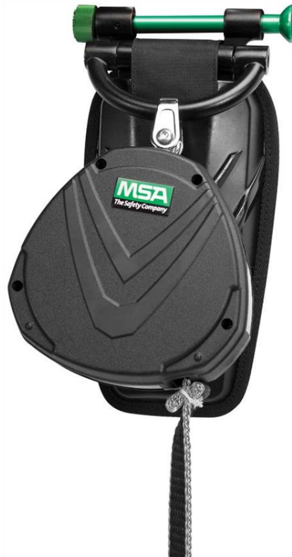
Figure 1: V-EDGE Web Personal Fall Limiter (PFL)

MSA has received an isolated field report that a bolt that connects the PFL ring to the Energy Absorber of the V-EDGE Web PFL separated from the unit, resulting in the unit being non-functional. MSA has not received any reports of injuries associated with this condition. However, we request that you perform the inspection outlined in this notice prior to your next use and include it in your pre-use checks and examination procedures.